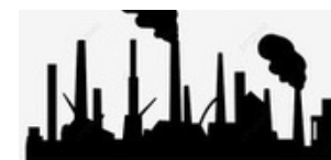
BOP for Mega Power Plant